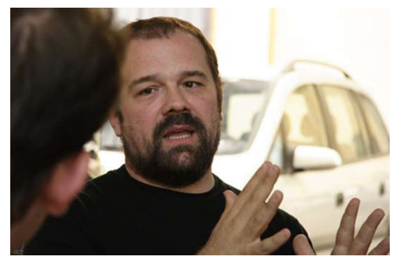
Massimo Banzi being interviewed in 2007

Quality does not directly or implicitly imply timelessness – something of quality may not achieve timelessness – but without quality something cannot be timeless. Timelessness may in fact not be attainable for electronic devices. Moore's law, which states that processor speeds will double every eighteen months, suggests that electronics do not age gracefully. Old electronics show their age and feel slow and limited. It is conceivable that an object with electronics can be designed and built such that its electronics are suited so well to the task that its speed or age do not affect the experience. But then the question becomes, what happens when we put the latest technology into this object? Does its experience become better, or cheaper or more enjoyable, or even easier? Classic objects and devices become nostalgic, while their modern counterparts become what get used for everyday use.